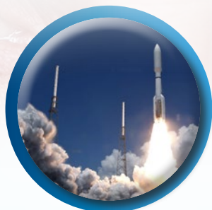
PREPARATION OF AMMONIUM PERCHLORATE USED IN ROCKET FUELS