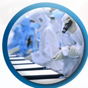
ETCHING OF LCD DURING MATERIAL TESTING